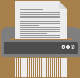
Shredded 100% Paper