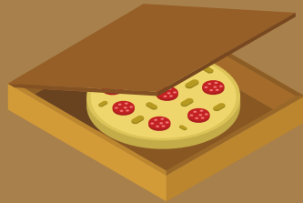
100% Paper or Cardboard Food-Soiled Items